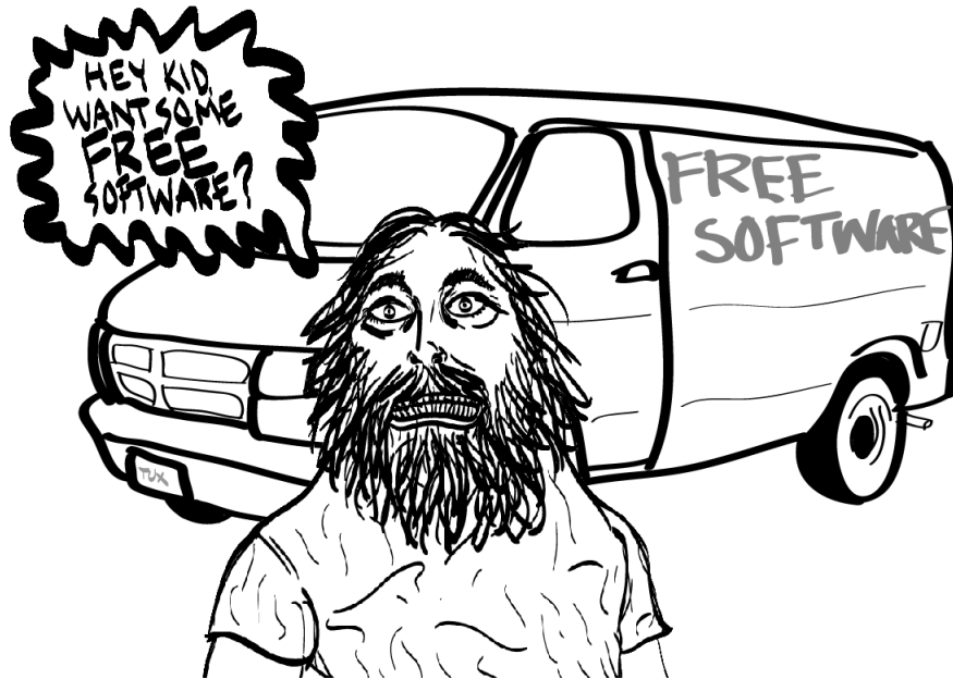
Figure 1: The GNU GPL Explained

need to first install the Rtools package. Rtools is not needed for Mac or Linux 2 platforms, and so memuse should install on them without problem.